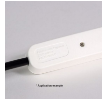
* Application example