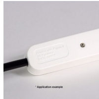
* Application example