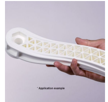
* Application example