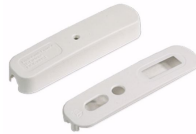
* Application example