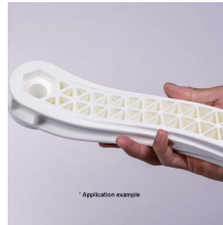
* Application example