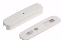
* Application example