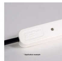
* Application example