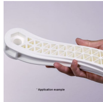
* Application example