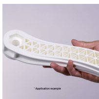
* Application example