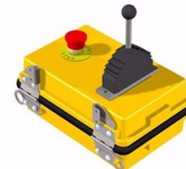
Optional Remote Pendant Control with Shoulder Harness