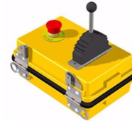
Optional Remote Pendant Control with Shoulder Harness