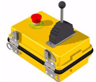
Optional Remote Pendant Control with Shoulder Harness